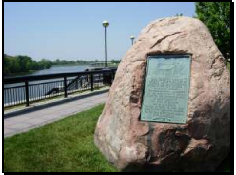
McCormick's Rock White River State Park, Indianapolis, Indiana