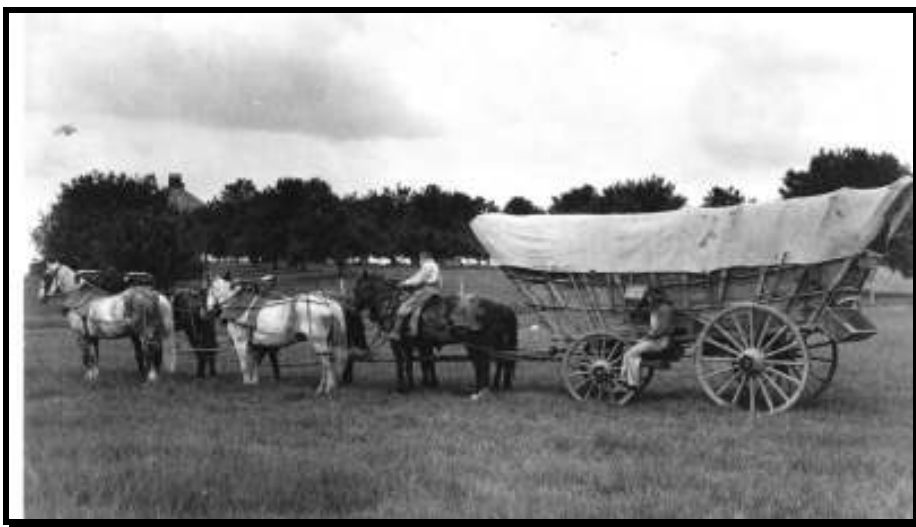
A Conestoga wagon used by pioneers in the 1700-1800s. Notice there is no buckboard in front of the wagon for the driver to sit – he either sat on a horse, walked along side, or used the “lazy board” located where the man is sitting on the side of the wagon.

They cut through the virgin forest, traveling by a Conestoga wagon (see photo) drawn by oxen. They started their journey in February, so they